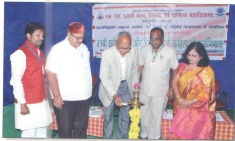
Inauguration of Hindi National Seminar