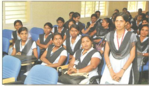
students Interaction in the Seminar