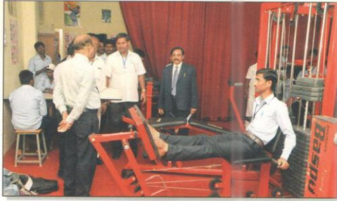
Gym & Other Activities