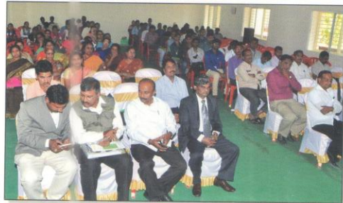
Delegates and Resource Persons in National Conference on NCABSEE-2016

M. S. IRANI DEGREE COLLEGE OF ARTS, SCIENCE AND COMMERCE