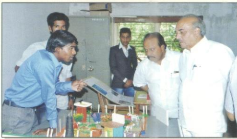
Students exhibiting Project