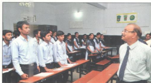
Students interaction with NAAC Peer Team Chairman

M. S. IRANI DEGREE COLLEGE OF ARTS, SCIENCE AND COMMERCE