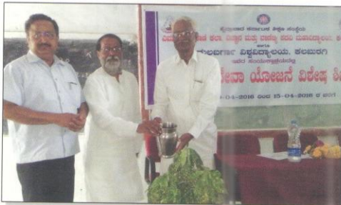
Inauguration of NSS Special Camp