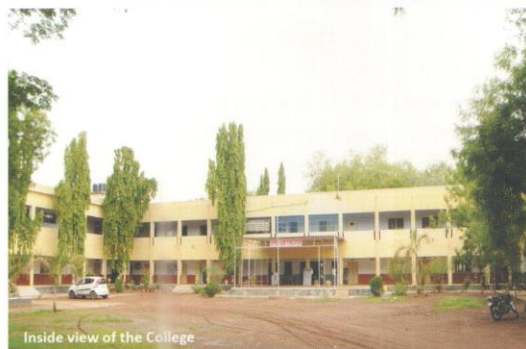
Inside view of the College

M. S. IRANI DEGREE COLLEGE OF ARTS, SCIENCE AND COMMERCE