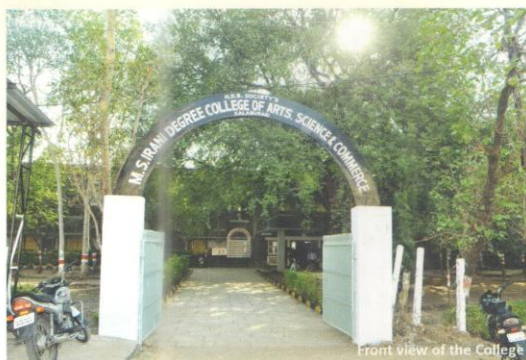
Front view of the College

AS PER GUK REGULATION THE CANDIDATE MUST & SHOULD SUCCESSFULLY COMPLETE DEGREE COURSE WITHIN SIX YEARS FROM THE DATE OF ADMISSION TO THE FIRST SEMESTER.