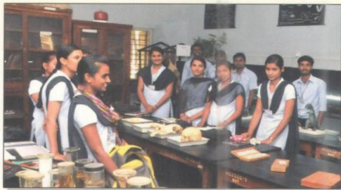
Students in Laboratory