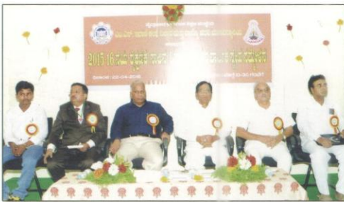
Annual Social Gathering Celebration