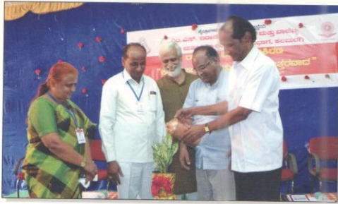
Inauguration of Kannada National Seminar